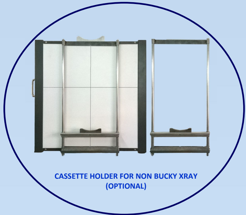
CASSETTE HOLDER FOR NON BUCKY XRAY (OPTIONAL)